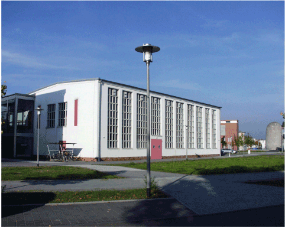
MBI's 'Max-Born-Saal', entrance from Carl-Scheele-Strasse.