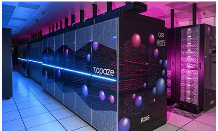
FIG 1. Left: Schematic representation of the acceleration of electrons then protons by TNSA (Target Normal Sheath-Acceleration) process in ultra-high intensity laser-solid interaction. Right: Supercomputer facilities at TGCC/CEA-DAM.